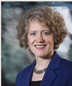
Corine Mauch, Stadtpräsidentin

Ich danke den Organisatorinnen und Organisatoren des Iranian Film Festival Zurich für ihr Engagement für die Filmstadt Zürich. Ich wünsche dem Festival für seine dritte Austragung viel Erfolg und Ihnen, liebe Festivalgäste, viel Vergnügen bei Ihren Entdeckungsreisen in die iranische Film- und Kinowelt.